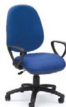
Office chair perm back height adjustable chairs N1121221