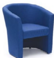
Tub seat open single N1121262