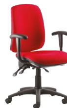
Office chairs model – Fus10