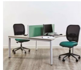
Mesa plus double sided double wave desking MEDFW1616