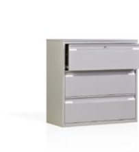
Freestor side filers - FleFreSid