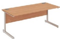
Office rectangular desk canter liver style mod panel no fixed ped beech. N11212902