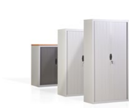
Freestor tambour units - FlexFreTam