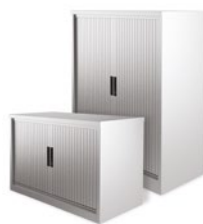
Tambour storage unit SCST7ESD