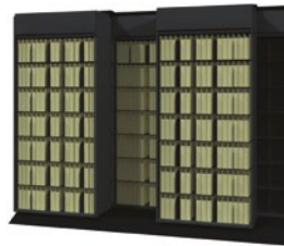
Thinline modular filing shelving THIN1