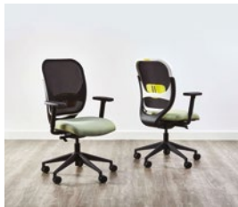
Oscar operator chair OSBBWYBAC