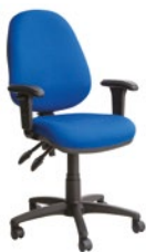
High back task chair KR032