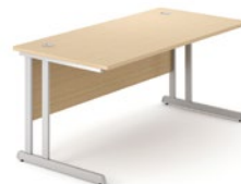
1600mm Cantilever desk DCA161