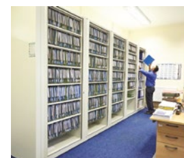
Prouette rotary storage unit