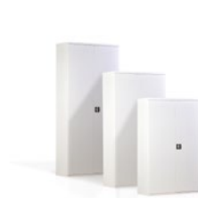
Metro storage cupboard - FleMetCup