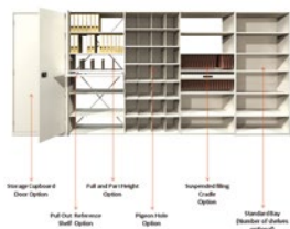
Fineline medical filing shelving FINE1