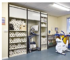
Adjustable shelving with doors