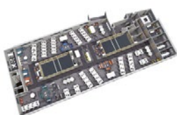
Design and planning service