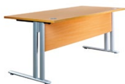
Desks and workstations model – Ess1680