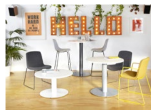
Additions pedestal base range