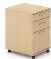
Under desk pedestal PSR525