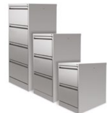
Filing cabinets model