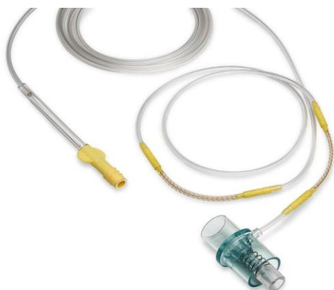
Microstream Advance Neonatal-Infant Intubated CO2 Filter Line