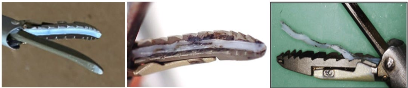
Figure 2. Example of Thunderbeat Probe in accordance with specifications (Left), Tissue Pad Deformation (Center), Tissue Pad Detachment (Right)