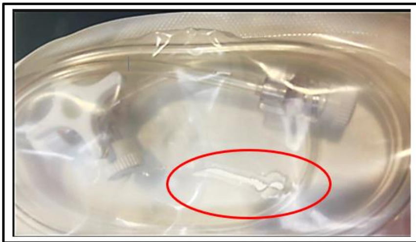
Figure 2: Rupture in the blister packaging