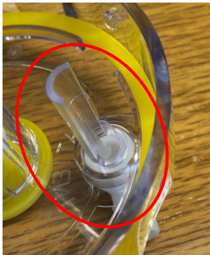
1 Defective Canister Lid