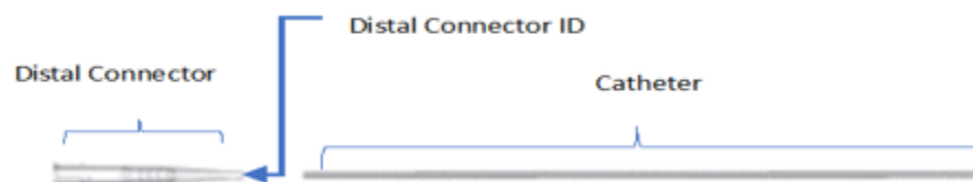
Figure 2: Distal Connector section – catheter insertion into distal connector