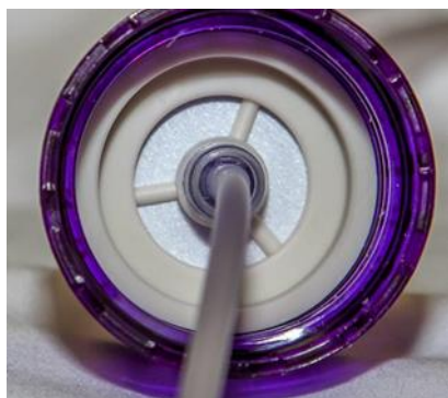
Fig 1 – Image of filter within the cap

We are contacting you urgently to replace any of the unfiltered water bottle caps that you may have with the filtered range. This will be done free of charge. If you are in any doubt, just look at the inside of the water bottle top to see if a filter is present. The below image shows what the filtered cap should look like.